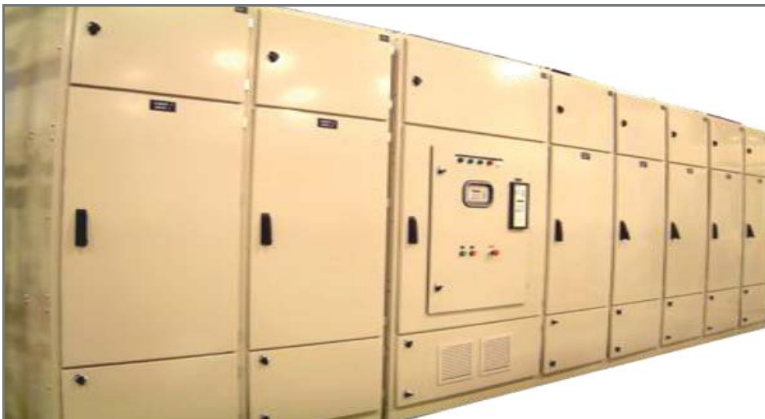
One Multi-Start Solcon HRVS-DN starting 4 synchronous motors at 6600V/600A - Cost effective with low spatial overhead

The Solcon HRVS-DN soft starter with its multi-start, starting capabilities proved to be the ideal solution for this application. The HRVS-DN line-up is built in a Multi-Start arrangement, starting each of the 4 synchronous motors sequentially.