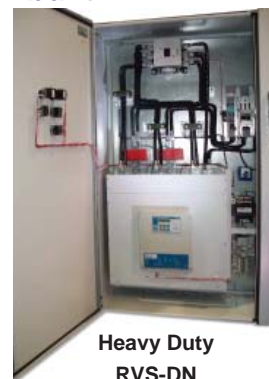
Heavy Duty RVS-DN